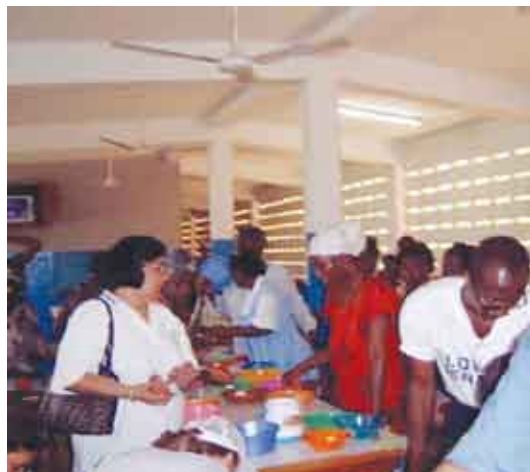
Sai devotees visited Pantang Psychiatric Hospital, Accra and distributed hot meals and fruits to patients.

Accra is the largest city in Ghana and its capital. Sri Sathya Sai Baba Centre of Accra celebrated Bhagavan's 81st Birthday by organising several functions from 19th to 25th November 2006. To begin with, Ladies Day was celebrated with Bhajans sung by 150 ladies of Indian and Ghananian origin at the Indian Culture Centre. Following this, several Bhajans were held in individual devotees' homes culminating in the grand celebration on the evening of November 23rd at the Sai