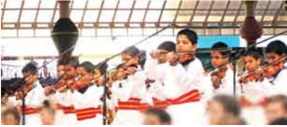
The students of Sri Sathya Sai Primary School made a thrilling presentation of violin music on Christmas morning.

tunes along with meaningful commentary, filling the entire milieu with joyous and pious Christmas spirit. The environment was further surcharged with divine vibrations by Bhajan singing which followed these musical presentations of the students. At the conclusion of Bhajans, Bhagavan graciously cut the cakes placed in the verandah and lighted candles on them. Bhagavan then went into the rows of devotees showering blessings and bliss on one and all. The morning programme came to a close with Arati to Bhagavan at 10.50 a.m.