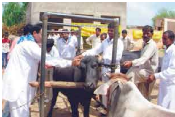
A veterinary camp was organised by Sirsa Samithi of Haryana wherein 377 animals were examined and given free treatment.

Haryana and Chandigarh: A veterinary camp was organised by the Sirsa Samithi in November 2006. In this camp, 377 animals were examined and given free treatment. Sirsa Samithi also organised a blood donation