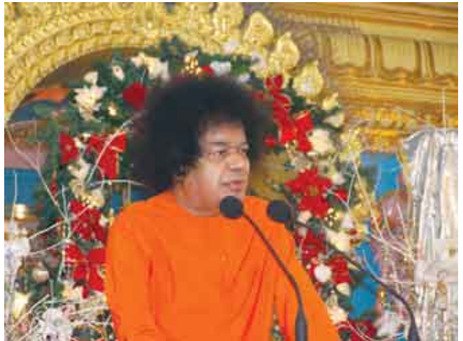
Bhagavan giving His Christmas Message in Sai Kulwant Hall on 25th December 2006.

After this, Bhagavan blessed the devotees with His Christmas Message and exhorted one and all to realise the unity of mankind