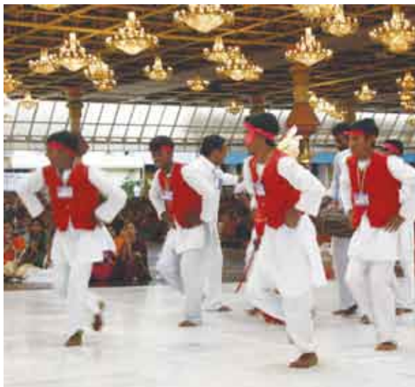
Folk dancers from Srikakulam presented a dance in Bhagavan's Divine Presence in Sai Kulwant Hall on the afternoon of 5th December 2006.

cultural items and offered their salutations to Bhagavan. After this, a soul-stirring programme of devotional songs was presented by their groups of singers, both ladies and