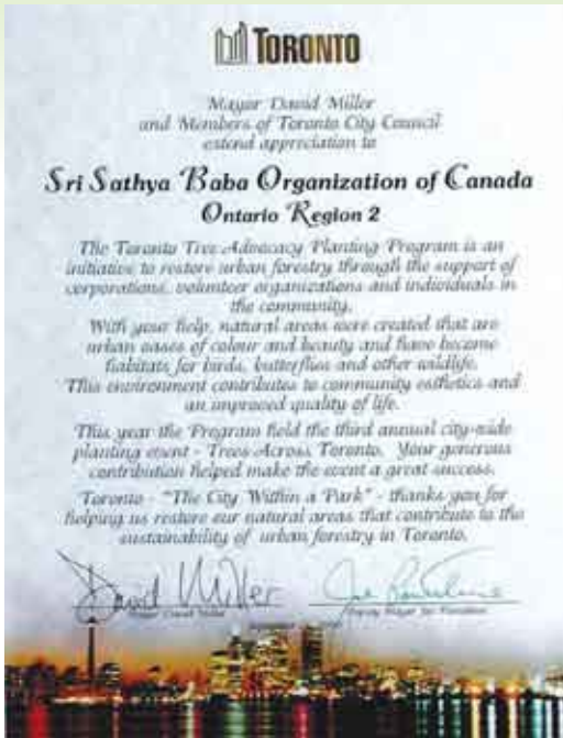
Award for the service rendered by the Sathya Sai Organisation of Canada.