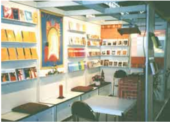
The German Sathya Sai Organisation participated in the Frankfurt Book Fair and displayed 120 books on Bhagavan Sri Sathya Sai Baba and His Mission.

I N THE WORLD OF PUBLISHING, Frankfurt Book Fair is one of the largest in the world and is held annually in Frankfurt. The five-day event started on 4th October 2006 and had over 7,000 publishers exhibiting publications to about 300,000