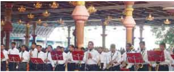
Brass band of Sri Sathya Sai Institute of Higher Learning delighted one and all by their sweet melodies on New Year Day.

The New Year 2007 was ushered in at Prasanthi Nilayam with divine melodies in the Divine Presence of Bhagavan Sri Sathya Sai Baba. On the morning of 1st January 2007, Bhagavan came to Sai Kulwant Hall at 7.25 a.m. amidst chanting of sacred Vedic hymns and showered His blessings on the huge gathering of devotees, both inside and outside the Hall. After Bhagavan was seated on the dais, the students of Prasanthi Nilayam campus of Sri Sathya Sai Institute of Higher Learning presented a grand programme of devotional songs, pouring out their heart to express gratitude to Bhagavan for His innumerable acts of grace. What followed this