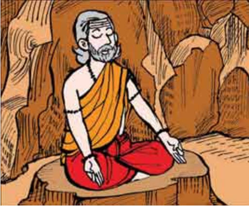
The serene environment of Vasishtha Guha was suitable for meditation.

ONCE A PERSON, HAVING developed the spirit of renunciation, left his house and started living at Vasishtha Guha near Rishikesh in the Himalayan region. The serene environment of this place was suitable for meditation.