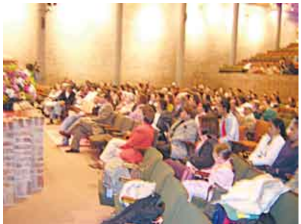
A symposium on “United for Peace” was organised by Sri Sathya Sai Organisation of Colombia on 21st October 2006.

On 21st October 2006, in the beautiful city of Santa Fe De Bogota, a symposium on “United for Peace” was held. It was organised by Sri Sathya Sai Organisation of Colombia with representatives from the following faiths: Catholic, Jewish, Buddhist, Islam,