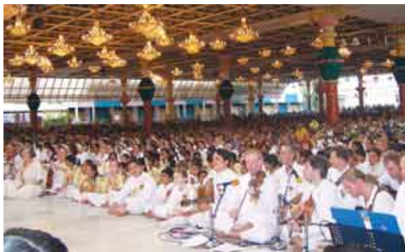
Excellent devotional songs and Christmas carols were presented both by children's choir and adults choir as part of Christmas celebrations at Prasanthi Nilayam.

choir. It was the children's choir comprising 84 children which presented its programme first. Unity, divinity and harmony found expression at their best when the children sang songs melodiously in praise of Rama, Krishna, Jesus, Shirdi Sai Baba, Bhagavan Sri Sathya Sai Baba, as also the traditional Christmas carols. This was followed by an excellent presentation of Christmas carols and devotional songs by the adults choir in which more than 600 singers