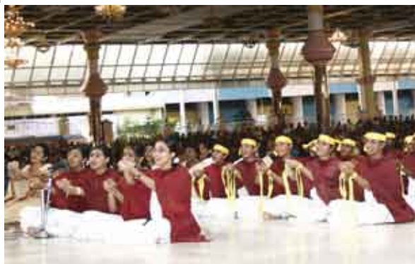
A scene from Dikir Barat presented by the devotees of Malaysia in Sai Kulwant Hall on 20th December 2006.

This short but beautiful cultural programme was presented by Sai Spiritual Education children of Malaysia in Sai Kulwant Hall on the afternoon of 20th December 2006. Through the medium of Dikir Barat, a traditional art form of Malaysia, the children showcased the composite culture of Malaysia, highlighting how filial piety was universally practised in the religio-cultural traditions of all faiths inhabiting Malaysia, viz., Chinese, Muslims and Hindus. The programme comprised rhythmic arms and