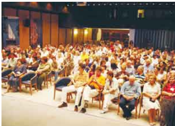
"The Joy of Awakening" was the theme of the spiritual retreat organised by the Croatian Sri Sathya Sai Organisation in Rovinj, Croatia.

Rovinj is a beautiful town located in the west coast of Istria on the Adriatic Sea. From 29th September 2006 to 1st October 2006, the Croatian Sri Sathya Sai Organisation held a spiritual retreat. The theme of the retreat was "The Joy of Awakening". Around 330