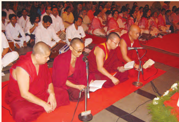
Buddhist monks reciting sacred chants as part of Buddha Purnima celebrations held at Sri Sathya Sai International Centre, New Delhi on 9th May 2009.

The sacred festival of Buddha Purnima was celebrated at Delhi on 9th May 2009. It was organised by Sri Sathya Sai Seva Organisation, Delhi at Sri Sathya Sai International Centre,