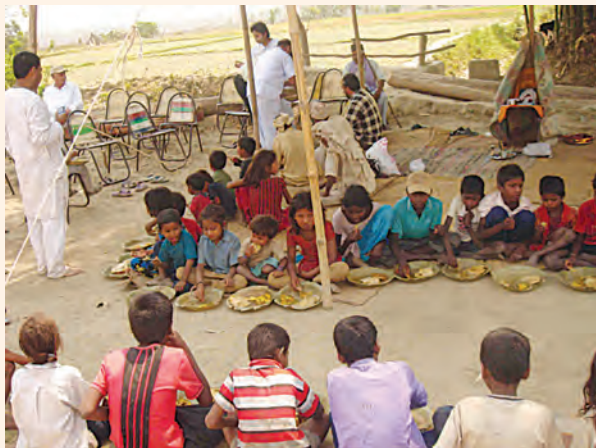
Sri Sathya Sai Central Trust of Nepal provided food, clothing and other articles of daily need to eight fire victim families who lost everything in a blazing fire. The Sai Organisation is also constructing new houses for these families.

On 10th March 2009, a blazing fire in a small hamlet damaged eight houses in their entirety. The fire victims lost everything in their homes and took shelter in fragile makeshift tents. On 12th March 2009, Sri Sathya Sai Central Trust