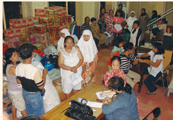
Doctors and Sai volunteers provided medical services to needy people who were rendered homeless in a fire in Jakarta on 25th January 2009.

A blazing fire on 25th January 2009 in Jakarta affected 133 families, and about 580