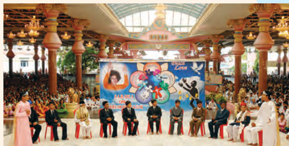
A scene from the drama “Samasta Loka Sukhino Bhavantu” presented by the students of Sri Sathya Sai Vidyaniketan, Navsari on 18th June 2009.

The programme began at 5.15 p.m. after the Divine Darshan of Bhagavan in Sai Kulwant Hall. First, the students of Sri Sathya Sai Vidyaniketan, Navsari presented the drama “Samasta Loka Sukhino Bhavantu” (May all the beings of all the worlds be happy!).