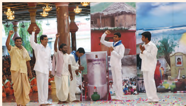
The drama "Prema Vahini" presented by the Sai Youth of Andhra Pradesh on 19th June 2009 highlighted the Seva activities being carried out by Sai Organisations in villages.

The drama entitled "Prema Vahini" (stream of love) commenced at 5.30 p.m. after the Divine Darshan of Bhagavan in Sai Kulwant Hall. The drama powerfully depicted how more and more youth were dedicating their lives to Grama Seva (service of villages) and bringing about transformation in the villages. Inspired by the teachings of love and service of Bhagavan