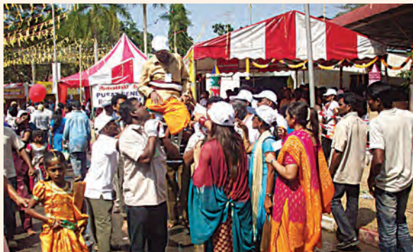
In a service project called "Journey to God", Sai Youth of Malaysia transport physically challenged persons to temples on festival days.

On 8th February 2009, Sai Youth of Malaysia from the States of Kuala Lumpur, Penang and Johor Bahru took part in a service activity called "Journey to God." The Sai Youth of Johor Bahru transported physically challenged adults to the Thandayuthapani Murugan Temple to witness the Thaipusam festival celebrations. Sai devotees lovingly provided lunch and welcomed them into their homes. Sai Youth of Kuala Lumpur took approximately 30