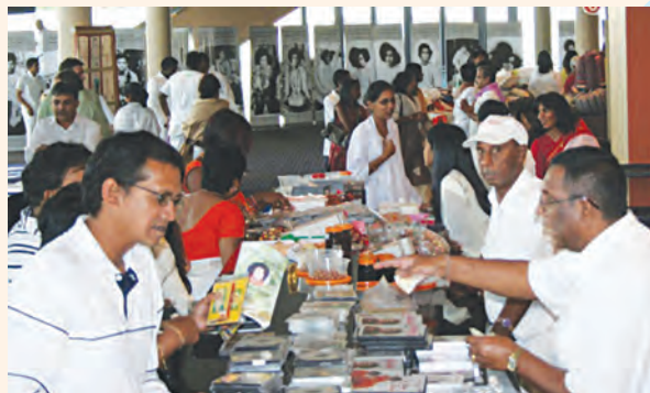
A Sai publications counter was set up during the National Sadhana Rally 2009 held on 11th and 12th April in Durban, South Africa. More than 6,000 devotees participated in this rally.

D URING EASTER WEEKEND ON 11th and 12th April, the National Sadhana Rally 2009 was held in Durban. More than 6,000 devotees attended this inspirational spiritual programme, which was organised in a large arena. The aisle and circumference of the arena included displays of creative arts and crafts, Sai