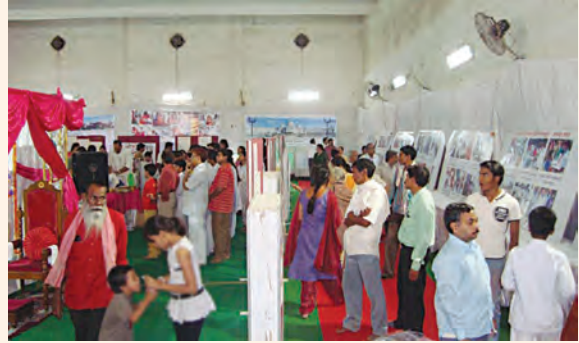
More than 4,000 visitors came to see the Sanathana Sarathi golden jubilee exhibition “Journey with Sai” held at Raipur, the capital of Chhattisgarh, from 1st to 4th May 2009.

places, was kept open for visitors from 9.00 a.m. to 11.00 a.m. and 4.00 p.m. to 9.30 p.m. daily. Special counters were set up in the exhibition for the sale of Sai literature and subscription of “Sanathana Sarathi” in Hindi, English and Telugu. During this period, more than 4,000 persons including many dignitaries and school students visited the exhibition. The video section of the exhibition showed films on Bhagavan and “Sanathana Sarathi”. Cultural programmes were also organised in the evening on all the four days. The people of Raipur and Bilaspur felt it a great blessing of Bhagavan which came in the form of this unique exhibition. After the conclusion of the exhibition, Easwaramma Week was