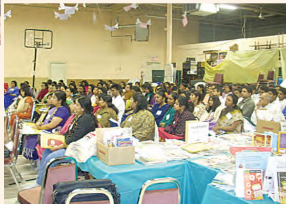
A two-day training workshop for training new Sai Spiritual Education Teachers was held in Toronto on 7th and 8th March 2009, in which about 130 participants from Ontario region took part, out of which 60% were youth.

A training workshop for new teachers of the Sai Spiritual Education (SSE) programme was conducted on 7th and 8th March 2009 in Toronto at the Sathya Sai School of Canada. About 130 participants from Ontario region attended this workshop, out of which 60% were youth. Currently, 1,360 students are in the SSE programme, with 102 teachers and 75 assistant teachers in this region. Since the number of students is on the increase, there is a constant need for training more teachers to teach SSE. Training workshops are conducted on a regular basis for new teachers, and refresher courses are conducted for existing teachers. The two-day training covered topics such as "The Life and Message of Bhagavan Sri Sathya Sai Baba", "SSE Programmes", "Sathya Sai Education in Human Values (SSEHV) Programmes" and "Principles of Educare". These were taught using presentations, group discussions and question-and-answer