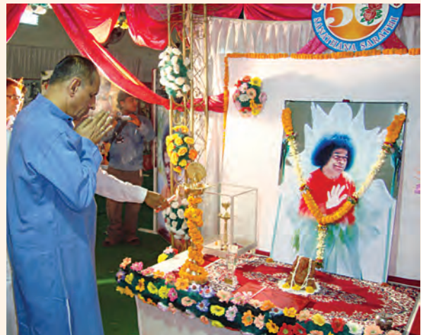
The Governor of Chhattisgarh, Sri E.S.L. Narasimhan offering salutations to Bhagavan at the beautiful altar set up in the exhibition “Journey with Sai” on 1st May 2009.

The exhibition, highlighting the humanitarian work of Bhagavan and His visits to various