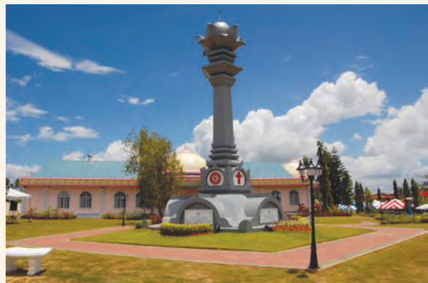
A Sarvadharm Stupa, a replica of the Stupa at Prasanthi Nilayam, was inaugurated on 26th April 2009 in the Easwaramma Sai Centre in Penal, South Trinidad. More than 400 devotees from all over the West Indies attended the inaugural function.

26th April 2009 was a red-letter day for Sai devotees in Trinidad and Tobago when a 36-foot high Sarvadharm (all faiths) Stupa was inaugurated in the Easwaramma Sai Centre located in Penal, South Trinidad. The Sarvadharm Stupa is the first of its kind in the West Indies region and is a replica of the Sarvadharm Stupa at Prasanthi Nilayam. During an interview in summer 2003,