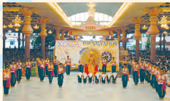
The students of Sri Sathya Sai School, Surat giving a demonstration of Asanas in Sai Kulwant Hall on 18th June 2009.

The next item of the programme was a musical skit on the theme of yoga as propounded by Maharshi Patanjali. This