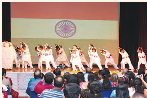
A cultural programme was held as part of Easwaramma Day celebrations in Bangkok on 3rd May 2009, in which 88 children featured a dance presentation and a song on human values.

On 3rd May 2009, Easwaramma Day celebrations took place in Bangkok. About 460 people attended the event. The programme began with Thai and Indian National Anthems and lighting of a lamp by the Indian Ambassador to Thailand. This was followed by chanting