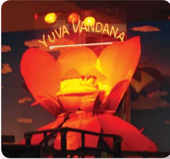
Youth Camp "Yuva Vandana 2006" was inaugurated by Bhagavan on the morning of 27th May 2006 by pressing a switch with which a huge lotus placed on the dais bloomed.