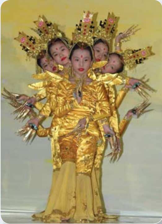
A beautiful formation made by the children of Nanyang School, Medan (Indonesia) during a scintillating dance performance in Sai Krishan Kalyana Mandapam.

traditional dance dedicated to Kwan Yin (Chinese goddess of mercy), they enraptured the audience by their movements and formations in their brilliant traditional costumes to the tune of lively Indonesian music. The second item of the programme was a short but powerful drama presented by the Sai Youth of Singapore depicting the life and teachings of Lord Buddha as described by Bhagavan Sri Sathya Sai Baba in His Discourses. The drama commenced with a courtroom scene to debate the existence of God. As the story progressed, two episodes from the life of Buddha were enacted which highlighted his principal teachings that control of senses was the key to enlightenment, and control of desires and purity of thought, word and deed were the