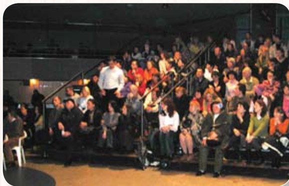
Public meeting in Belgrade where Bhagavan's glory and His humanitarian work were highlighted.

The independent republics of Serbia and Montenegro are located in the Balkan Peninsula bordering the Adriatic Sea. A public meeting was held in its capital city Belgrade on 12th