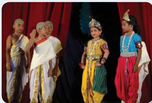
A scene from the drama "Bhakta Sudama" presented by the Bal Vikas children of Bangalore in Sai Krishan Kalyana Mandapam.

On the evening of 6th May 2006, Bal Vikas children of Bangalore presented a beautiful drama "Bhakta Sudama" in Sai Krishan Kalyana Mandapam depicting how Lord Krishna showered His love and bounty on His friend and classmate Sudama. Good acting of the children, appropriate costumes, excellent sets, sweet songs and crisp dialogues made