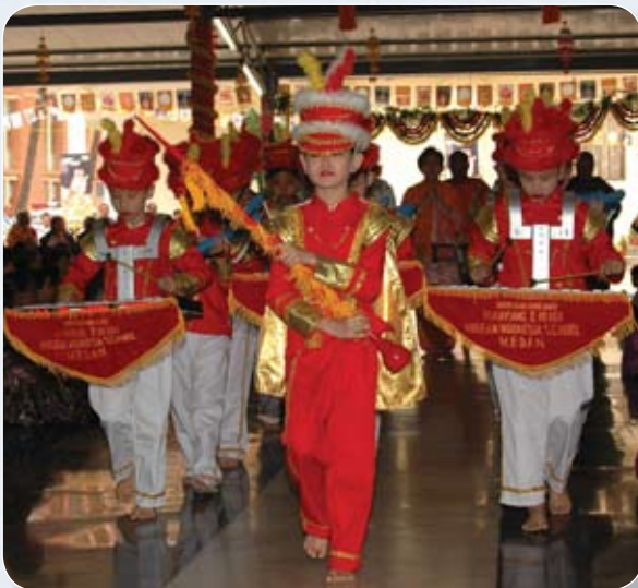
Grand display of devotional tunes by the children's band of Indonesia on the holy day of Buddha Purnima in Sai Ramesh Krishan Hall.

seat on the dais, bouquets were offered to welcome Him. Bhagavan then blessed the flowers which were offered at the altar by Sri Karu Jayasuriya of Sri Lanka. Meanwhile, children's band took position in front of the dais and delighted one and all with a grand display of devotional tunes. Soon after this, the devotees of host countries (Brunei,