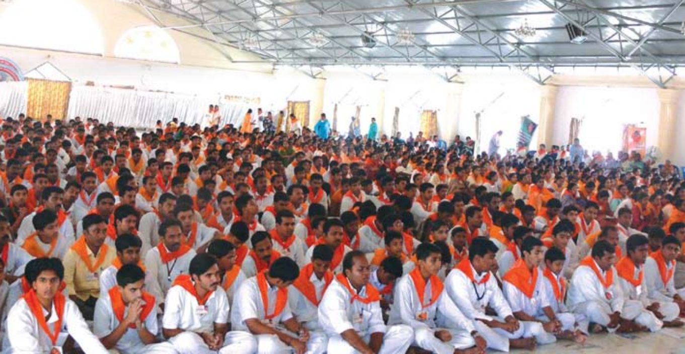
A Plenary Session of the Youth Camp in progress in Sai Krishan Kalyana Mandapam, Brindavan.