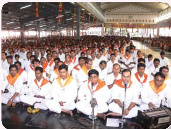
Soul-stirring Bhajans led by Sai Youth of Kerala formed an important part of the Sadhana Camp organised at Brindavan on 19th-21st May 2006.

On the morning of 19th May 2006, Bhagavan came to the richly decorated Sai Ramesh Krishan Hall amidst auspicious notes of Nadaswaram. Bhajans in the Hall, after the arrival of Bhagavan were led by Sai Youth of