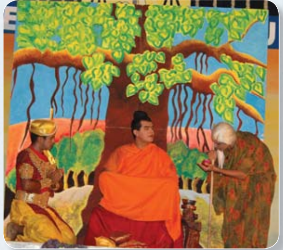
A scene from the drama presented by the Sai Youth of Singapore in Sai Krishan Kalyana Mandapam, Brindavan.

traditional dance dedicated to Kwan Yin (Chinese goddess of mercy), they enraptured the audience by their movements and formations in their brilliant traditional costumes to the tune of lively Indonesian music. The second item of the programme was a short but powerful drama presented by the Sai Youth of Singapore depicting the life and teachings of Lord Buddha as described by Bhagavan Sri Sathya Sai Baba in His Discourses. The drama commenced with a courtroom scene to debate the existence of God. As the story progressed, two episodes from the life of Buddha were enacted which highlighted his principal teachings that control of senses was the key to enlightenment, and control of desires and purity of thought, word and deed were the