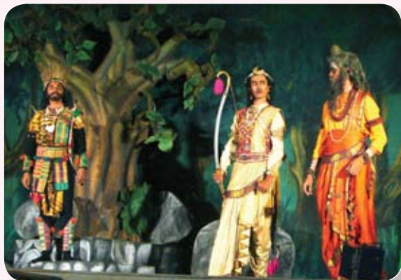
A scene from the drama "Ekalavya" presented by the Youth Wing of Sri Sathya Sai Seva Organisation of Karnataka on 27th May 2006.

This excellent drama depicting the rare devotion of the tragic hero of Mahabharata, Ekalavya, to his preceptor Dronacharya was presented by the Youth Wing of Sri Sathya Sai Seva Organisation of Karnataka in Sai Krishan Kalyana Mandapam on the evening of 27th May 2006. The drama commenced