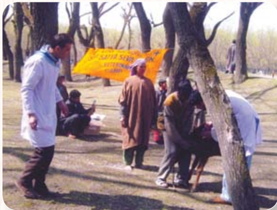
Free veterinary camp organised by Sri Sathya Sai Seva Organisation of Jammu and Kashmir in a village to help the villagers.

Jammu and Kashmir: A free veterinary camp at Zohama, tehsil Chadoora of district