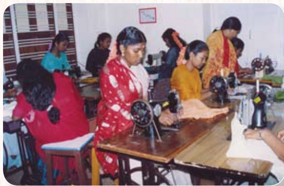
Sri Sathya Sai Seva Organisation, Tamil Nadu has made more than 80 women self-reliant in the Mahila Vocational Training Centre, Chennai Metro.

Tamil Nadu: The Mahila Vocational Training Centre started by Sri Sathya Sai Seva Organisation, Tamil Nadu in Chennai Metro in March 2001 has so far imparted vocational training in tailoring and other vocations to