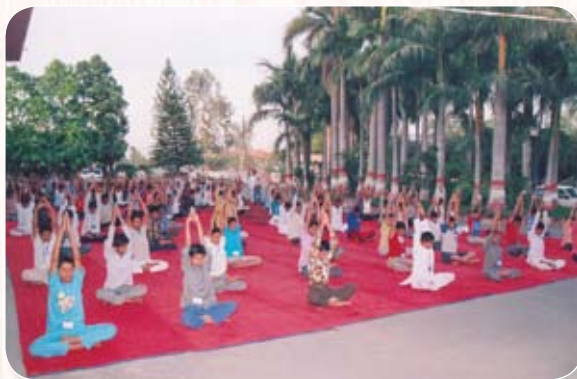
Yoga practice was one of the activities of the Summer Course on Indian Culture and Spirituality held at Indore.

The day started at 5.20 a.m. and all the students participated daily in Omkaram, Suprabhatam and Jyoti Dhyana followed by