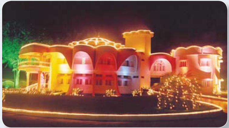
Trayee Brindavan, the abode of Bhagavan in Brindavan (Whitefield), gloriously illuminated on its 23rd Anniversary celebrations.