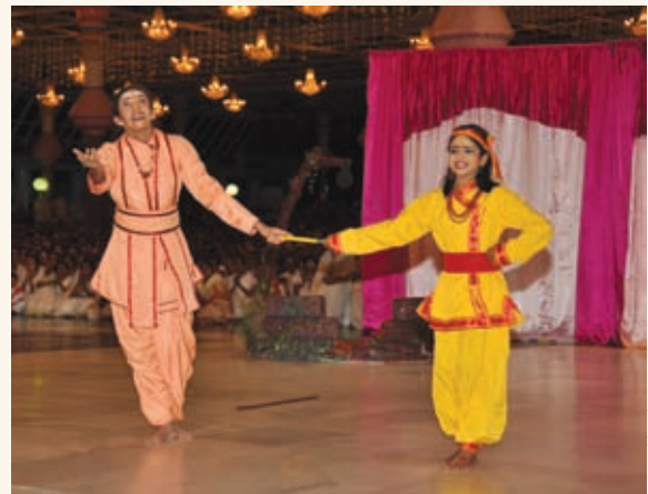
Bal Vikas children of Kerala presented a drama entitled "Sant Surdas" on 25th April 2010 which portrayed the life story of this saint poet.

A large number of Kerala devotees came to Prasanthi Nilayam to celebrate Kerala New Year, Vishu. As part of Vishu celebrations, Bal Vikas children of Kerala presented a drama entitled "Sant Surdas" on 25th April 2010 which commenced at 6.25 p.m. after Bhagavan's Darshan in Sai Kulwant Hall. The drama portrayed the life story of Surdas whose devotion-filled immortal lyrics have been inspiring generations of devotees and sowing