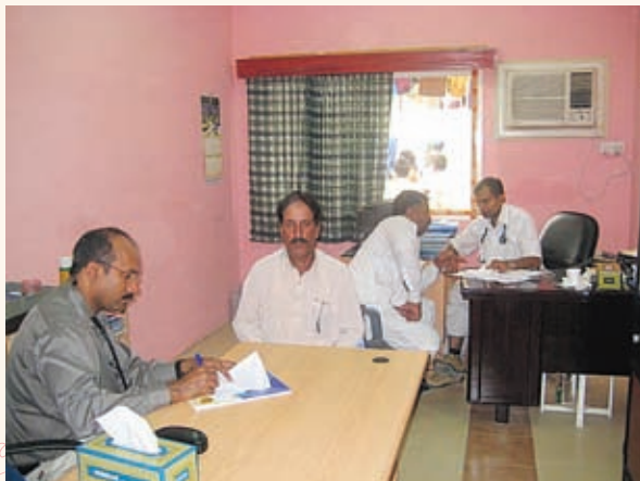
On 5th February 2010, Sathya Sai Group of Dubai conducted a medical camp at the Saleh Construction LLC labour camp in Sonapur where a labour force of about 3,000 people of different nationalities resides.

For over 12 years, the Serve and Inspire (SAI) Group, Dubai has been organising blood donation camps three times a year in cooperation with the Al Wasl Hospital Blood Bank. The final blood donation camp of 2009 took place on 25th December. The Dubai