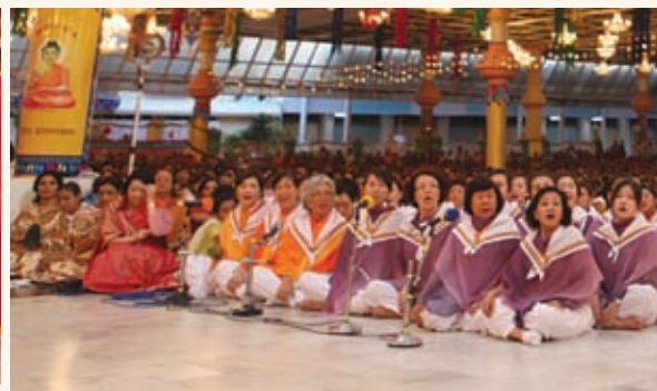
A choir of Malaysian devotees presented a medley of Bhajans on 28th May 2010 as part of Buddha Purnima celebrations at Prasanthi Nilayam.