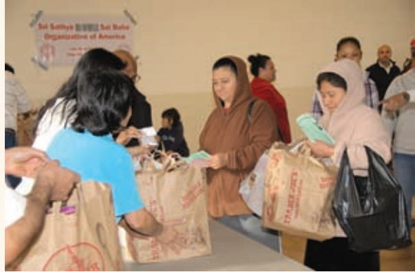
Sathya Sai volunteers from Arcadia and Glendale Sai Centres distributed food and toiletry items to over 500 families on 9th January 2010.

On 9th January 2010, the Sathya Sai Centres of Arcadia and Glendale provided essential food and toiletry items to over 500 families. Sathya Sai volunteers purchased the items, packed them into bags and distributed them to the three agricultural communities of Moorpark, Oxnard and Santa Paula. These communities have large populations of farm workers. Each food bag contained rice, beans, sugar, cooking oil, peanut butter and breakfast