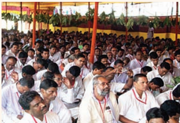
A section of the delegates to the 34th State Conference organised by Sri Sathya Sai Seva Organisation of Orissa at Rayagada, Orissa.

64 District Presidents and Resource Persons and facilitated sharing of views on the following subjects: SSS-Housing Project – Our Experience and Future Roadmap, SSSVIP – Our Approach and Achievements, Rules and Regulations of SSSSO and our Strategy, Strengthening Bal Vikas and Mahila Vibhag (Women’s Wing), Youth Activities and Vedic Choir, Holistic Healthcare and Animal Care. Group Discussions were also conducted at different venues on the following topics: Techno e-Media, Vocational Training and Career Guidance, Digital Archives, Website and Reporting, Holistic Animal Care, Sri Sathya Sai Schools, Sathya Sai Ambulance and Holistic Health Seva. A symposium on “The Dawn of Golden Age” was organised in the open session. The State President conducted separate meetings among all State office bearers, District Presidents, District Youth Coordinators, etc., to enable in-depth interaction and formulation of future action plans.