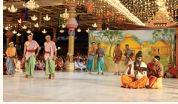
The drama "Angulimala" enacted by the Bal Vikas children and Sai Youth of Thailand on 28th May 2010 demonstrated how loving and kind words of Buddha transformed a fearsome murderer into a great saint.

The last item of the programme was a drama entitled "Angulimala" which was presented by Bal Vikas children and Sai Youth of Sri Lanka. The drama depicted the story of transformation of Angulimala from a fearsome