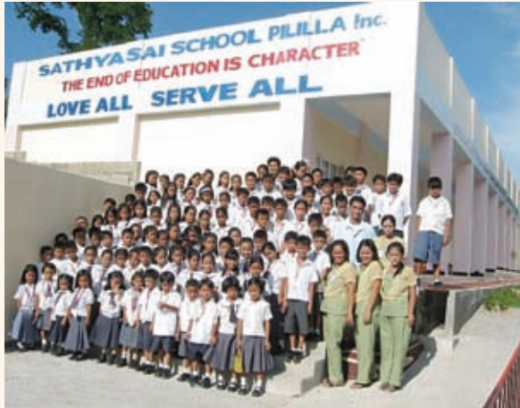
Sri Sathya Sai School of Philippines celebrated its 10th anniversary on 20th March 2010.

Sai School sang the National Anthem of the Philippines. Dr. A.P.J. Abdul Kalam, former President of India, sent a personal message, in the form of certificates quoting Bhagavan's teachings, for all the graduating children. A pictorial publication, titled "Sowing the Seeds for Human Excellence", was released in commemoration of the 10th anniversary. The publication summarised all the Educare activities, including teacher training, human values contests held throughout the Philippines, Chancellor's Day events since 2006 (commemorating Swami's Birthday as a public function) and all of the SSSO's various social and medical service activities.