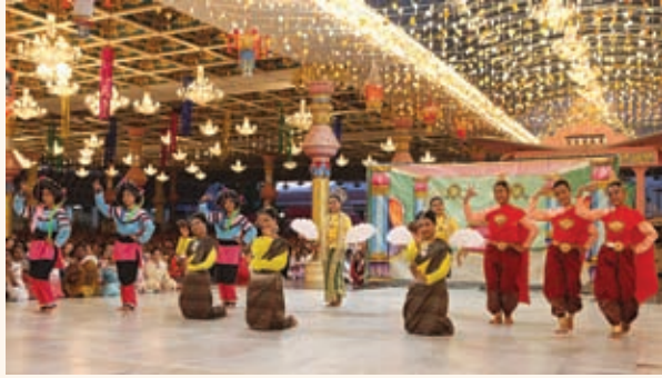
Three groups of students of Sathya Sai School, Thailand performed beautiful dances in the traditional dress of various regions of their country in Sai Kulwant Hall on 28th May 2010. The picture shows all the groups dancing together.

various regions of their country and performed a dance as per that region's tradition to the delight of the devotees in the hall. Finally, all the three groups performed an exhilarating dance together.