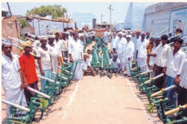
Sri Sathya Sai Seva Organisation of Andhra Pradesh distributed multipurpose agricultural implements to 300 flood-affected farmers of Kurnool district on 6th April 2010.

Sri Sathya Sai Seva Organisation of Andhra Pradesh distributed various implements to rehabilitate and provide means of livelihood to 98 helpless flood-affected persons of Kurnool district in a function held in Sri Sathya Sai Seva Sadan, Kurnool on 5th April 2010. The implements included sewing machines, wet grinders, barber and electrician kits, bicycles, etc. The Collector of the district and State President of Andhra Pradesh also attended this function. In another function held on 6th April 2010 in Sangala village, 53 km away from Kurnool town, 300 selected flood-affected farmers from Sangala, Gundrevula and Earladinne villages assembled to receive the multipurpose agricultural implements used for