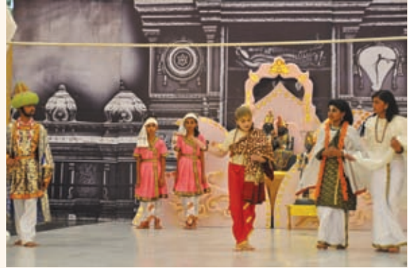
On 6th May 2010, Bal Vikas children of Karnataka presented a drama "Bhadrachala Ramdas" in Sai Kulwant Hall.

The programme in the evening consisted of a drama entitled "Bhadrachala Ramdas"