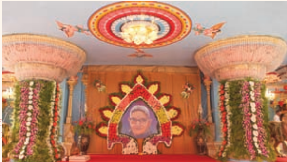
A beautiful portrait of Mother Easwaramma adorned the dais where attractive decorations were made with flowers on Easwaramma Day.

Easwaramma Day was celebrated at Prasanthi Nilayam in the sacred memory of Mother Easwaramma on 6th May 2010. On this occasion, elaborate decorations with