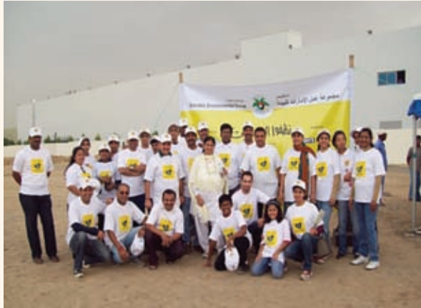
Volunteers of Sri Sathya Sai Service Organisations of Dubai, Abu Dhabi and Sharjah took part in the annual Clean Up U.A.E. 2009, organised by Emirates Environmental Group on 12th December 2009.

Al Akhdar (Abu Dhabi) and Sharjah Corniche (Sharjah).