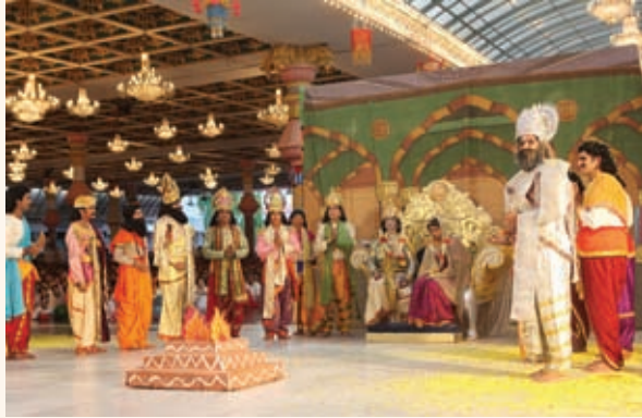
A scene from the dance drama "Lava Kusha – Ramakatha" presented by the students of Sri Sathya Sai University on 25th May 2010.

costumes and make-up, and efficient stage management made the drama absorbing and enrapturing. At the conclusion of the drama, Bhagavan blessed the cast, posed for group photos with them and distributed clothes to them. He also materialised a gold chain for the student who enacted the role of Sita and a gold ring for the student who enacted the role of Kusha. The drama which started after Bhagavan's Darshan at 6.10 p.m. came to a close at 6.55 p.m. Arati was offered to Bhagavan at 7.10 p.m. which marked the conclusion of the programme.