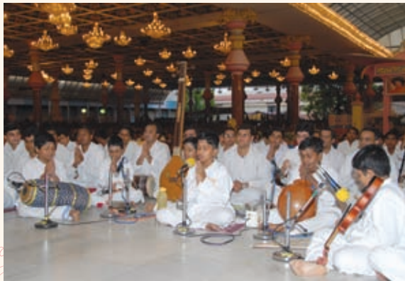
Bal Vikas children of Tamil Nadu gave a scintillating Carnatic music performance on 24th April 2010 as part of Tamil New Year celebration at Prasanthi Nilayam.

In the evening, six Bal Vikas children of Tamil Nadu presented a scintillating Carnatic music programme entitled "Thyagaraja Vaibhavam" (glory of Thyagaraja), expressing their refined