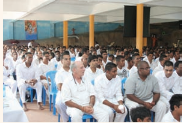
A section of the delegates to the South African National Youth Conference held in Durban on 20th March 2010.