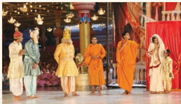
The devotees of Thailand presented a drama entitled "Yashodhara" on 27th May 2010 as part of Buddha Purnima celebrations at Prasanthi Nilayam.

The second day's programme of Buddha Purnima celebrations comprised three items. The first item was a medley of Bhajans which started at 6.25 p.m. after Bhagavan's Darshan in Sai Kulwant Hall on 28th May 2010. The Bhajans were presented by a choir of Malaysian devotees, both ladies and gents, who rendered them with total perfection of tune, rhythm and pronunciation though most of the Bhajans were in Hindi. This was followed by dances of three groups of students of Sathya Sai School of Thailand who came in the traditional dress of