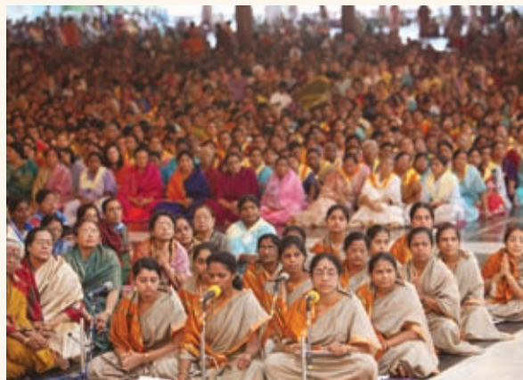
Bal Vikas Gurus of Karnataka presented a soulful programme of devotional songs in Sai Kulwant Hall on 23rd May 2010.

On 23rd May 2010, Bal Vikas Gurus of Karnataka offered a bouquet of devotional songs at the Lotus Feet of Bhagavan as part of His 85th Birthday celebrations. Commencing their programme after Bhagavan's Darshan in Sai Kulwant Hall, Bal Vikas Gurus, both ladies and gents, presented devotional and patriotic songs with deep devotion and love. These