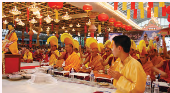
Buddhist monks chanting sacred Buddhist Mantras in Sai Kulwant Hall on 30th January 2009, on the eve of Chinese New Year celebrations at Prasanthi Nilayam.

On the eve of Chinese New Year, a soul-elevating programme of chanting of sacred Buddhist Mantras for world peace was held on the afternoon of 30th January 2009. About 40