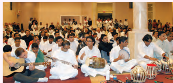
Over 1,300 devotees participated in Bhajans held as part of Bhagavan's 83rd Birthday celebrations in the Toronto-York Centre of Canada on 23rd November 2008, which also marked the inauguration of the new building of this Centre.

The inaugural event of the new Toronto-York Sai Centre building began on 21st November 2008 and culminated with Bhagavan's 83rd Birthday celebrations on 23rd November 2008. A 1,800 square metre property was purchased in March 2007. The youth worked tirelessly while removing walls, flooring and ceiling of the previous structures so that new construction could begin. Over a period of 18 months, the Centre building, consisting of Bhagavan's residence, a large prayer hall, seven classrooms, a library, a