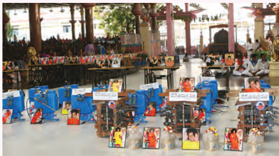
Sai Organisation of Chittoor district organised the distribution of various implements to 84 needy persons to enable them to earn their livelihood. The picture shows the implements placed for distribution in Sai Kulwant Hall on 4th February 2009.

programme which started at 5.25 p.m. came to a close with Arati to Bhagavan at 6.00 p.m.