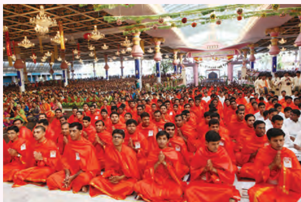
Sai Kulwant Hall reverberated with the collective chanting of Rudram on the morning of 23rd February 2009 when thousands of Sai Youth, students and devotees recited the Mantras in unison.

A grand programme of collective chanting of Rudram, the hymns dedicated to Lord Siva, was organised at Prasanthi Nilayam on the occasion of Sivarathri. More than 1,000 Sai Youth specially came from various parts of Karnataka to participate in this sacred programme. Sai Kulwant Hall, the venue of