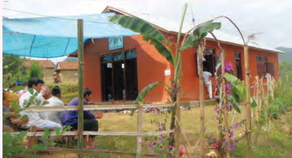
The Bhajan Hall in a remote village Balthali built exclusively by Sai Youth stands as a testimony of their self-sacrifice, devotion and love for Bhagavan.

Balthali, a village located deep inside the hills, approximately 55 kilometre east of Kathmandu has a Sai Centre which was built exclusively by Sai Youth as an expression of their love for Bhagavan. The establishment