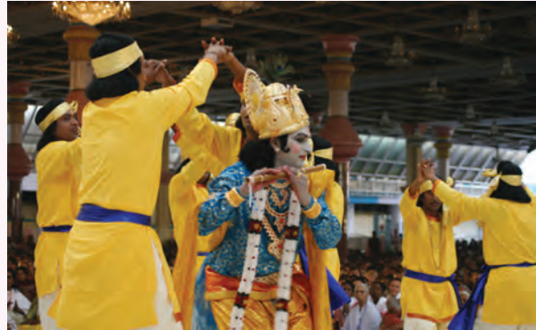
A group of youth from Karakorai village of Nilgiris presented their traditional folk dance entitled “Brindavan Folk Dance” which depicted the glory of Lord Krishna.

About 20 saints and heads of various Ashrams along with more than 200 devotees came from Nilgiris, Tamil Nadu to Prasanthi Nilayam on a pilgrimage from 16th to 18th February 2009 and experienced the bliss of divine proximity of Bhagavan. On 17th February, a group of youth from Karakorai village of Nilgiris presented a dance programme entitled “Brindavan Folk Dance” in Sai Kulwant