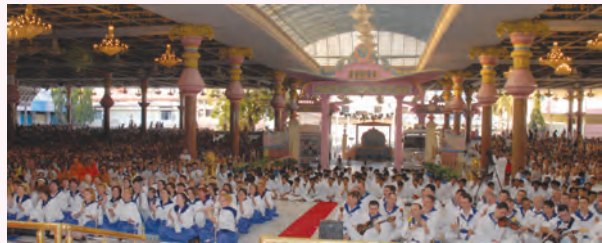
Singers and musicians of Hungary presented a soul-stirring programme of devotional music in Sai Kulwant Hall on 16th February 2009.

A group of 160 devotees came to Prasanthi Nilayam from Hungary in the beginning of February 2009, experienced the bliss of divine proximity of Bhagavan and basked in the supreme peace of Prasanthi Nilayam. More than 60 of them formed a Hungarian musical choir which presented a soul-elevating programme of devotional music in