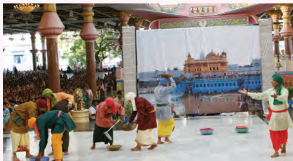
The drama entitled "Aastha" enacted by the youth of Delhi on 28th January 2009 showcased the rich cultural and religious traditions of Punjab and highlighted the teachings of Bhagavan.

On 28th January 2009, these youth presented a cultural programme comprising a drama and devotional songs in Sai Kulwant Hall in the Divine Presence of Bhagavan. The drama entitled "Aastha" (faith) which