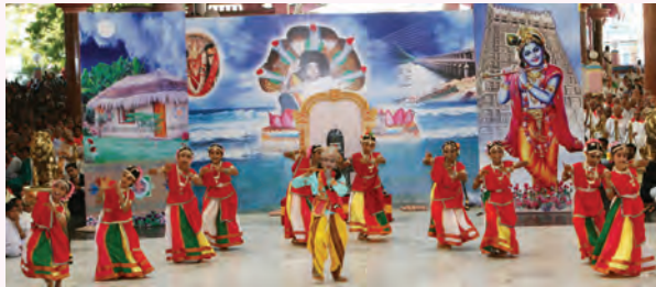
Bal Vikas children and youth of Krishna district of Andhra Pradesh performed a musical dance drama on 25th January 2009 which depicted the glory of Lord Krishna and highlighted the teachings of Bhagavan.

On the afternoon of 25th January 2009, Bal Vikas children and youth of this district presented a musical dance drama entitled