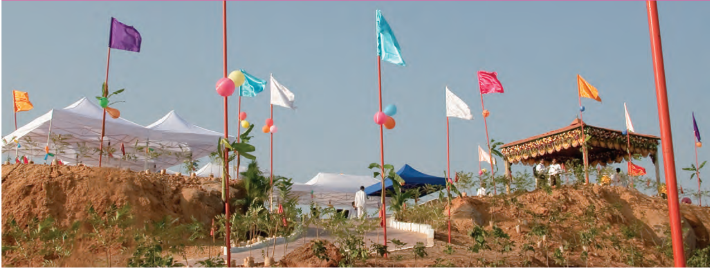
The site of the new campus of Sri Sathya Sai University at Muddenahalli.