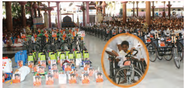
A large number of physically challenged and needy persons were given useful items in Sai Kulwant Hall on 27th January 2009. (Inset) A physically challenged child after receiving Bhagavan's blessings and a tricycle. Bhagavan also materialised a gold chain for him and put it around his neck with His Divine Hands.

On the afternoon of 27th January 2009, Bhagavan distributed various items of practical use to physically challenged and needy people in Sai Kulwant Hall. As the organisers announced the names of the beneficiaries,