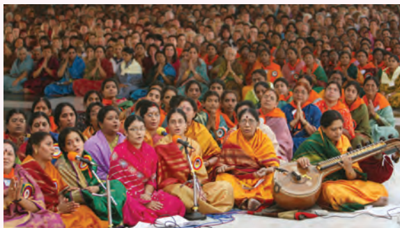
A group of singers of Andhra Pradesh made an excellent presentation of devotional music in Sai Kulwant Hall on 10th February 2009.

A group of more than 1,000 women devotees came on a pilgrimage to Prasanthi Nilayam from various parts of Andhra Pradesh from 8th to 10th February 2009. During their stay at Prasanthi Nilayam, they performed a special Puja (worship) and presented a music