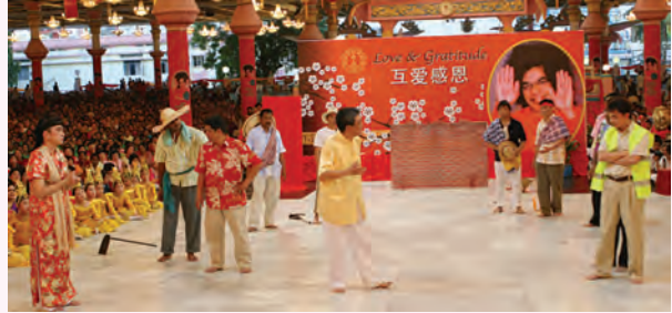
The drama "Love and Gratitude" performed by the Chinese youth as part of Chinese New Year celebrations at Prasanthi Nilayam was suffused with the teachings of Bhagavan and traditional Chinese values.

The highlight of the programme was a drama entitled "Love and Gratitude" which depicted the story of a teacher and his wife waiting for their son to return home for the Chinese New Year. The teacher who taught human values and traditional values of filial piety to the children of his village community was mocked by villagers as his own rebellious son had not returned home for many years since he left for his studies in the United States of