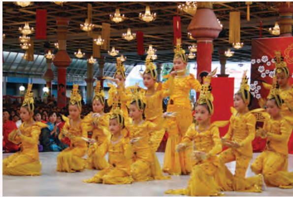
Bal Vikas children from Indonesia performing a dance titled "Thousand Arms of Kuan Yin" as part of Chinese New Year celebrations at Prasanthi Nilayam on 31st January 2009.

The cultural programme then started with a beautiful dance titled "Thousand Arms of Kuan Yin" by 20 Bal Vikas children from Indonesia.