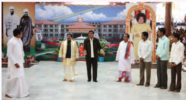
A scene from the drama "Prema Sankranti" presented by the Bal Vikas children and youth of Prakasam district on 12th February 2009.

On 12th February, a group of Bal Vikas children and Sai Youth of this district presented a musical dance drama entitled "Prema Sankranti" in Sai Kulwant Hall in the Divine Presence of Bhagavan. The drama, which began with a beautiful dance by a group of Bal Vikas children, highlighted how Bhagavan's teachings like "Love All, Serve All"