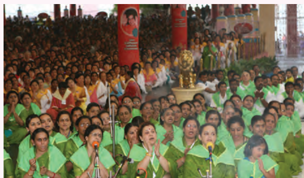
A section of overseas singers presenting the musical programme "Madhura Bhakti Dhara" in Sai Kulwant Hall on 29th January 2009.

About 370 devotees came on a pilgrimage to Prasanthi Nilayam from Abu Dhabi, Bahrain, Dubai, Kuwait, Oman, Sharjah, Saudi Arabia, Iran and Turkey. During their stay at Prasanthi Nilayam from 25th to 31st January 2009, they attended Darshan and Bhajan