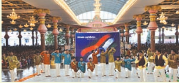
The drama “Namami Bharatiyam” presented by the youth of Hyderabad brought alive the memories of the role played by the youth in the Freedom Movement of India.

Sai Baba. Interspersed with patriotic songs and dance sequences, the drama particularly showcased “Sri Sathya Sai Reprogramming Lives Programme” undertaken by the Sai Youth of Hyderabad, through which they were uplifting unemployed and underprivileged youth and reshaping their lives. Bhagavan blessed the youth at the conclusion of the drama and posed for group photos with them.