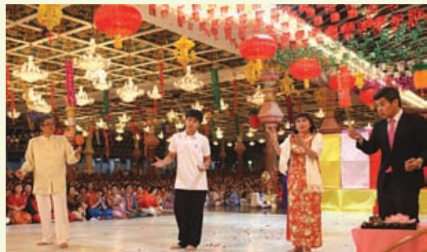
The drama "Unity is Divinity" highlighted the importance of Bhagavan's teachings and traditional Chinese values for peace and harmony in the family.

drama depicted how the loss of traditional Chinese values in a family resulted in conflict between all its members and disturbed the peace and harmony of the family. It also showed how peace and harmony was restored in the family when the members of the family followed the teachings of Bhagavan and the traditional Chinese values on the advice of the eldest member of the family. The theme of the drama was reinforced and illustrated further by a couple of episodes from Chinese history and culture. Excellent acting of the cast, superb direction, sublime theme, realistic story with a touching climax made the drama a very