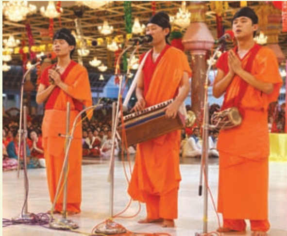
An excellent programme of "Burra Katha" was presented by three Malaysian youth as part of Chinese New Year celebrations on 20th February 2010.

through dialogues and songs how unbounded love and compassion that marked the life of Lord Buddha was being manifested in the life and teachings of the present Avatar of Lord Vishnu, Bhagavan Sri Sathya Sai Baba who is providing free education, free healthcare and drinking water to the underprivileged masses. Every dialogue highlighting the glory of Bhagavan was followed by an appropriate devotional song, Bhajan, Vedic chant or Sanskrit verse, all of which were rendered by the youth with total perfection, which made the entire presentation a masterpiece of the art of Burra Katha ever presented by overseas youth at Prasanthi Nilayam.