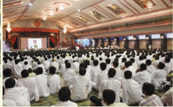
A large number of educationists including Vice Chancellors of eight universities participated in the Educationists’ Conclave organised by the youth of Hyderabad in Poornachandra Auditorium on 30th January 2010.