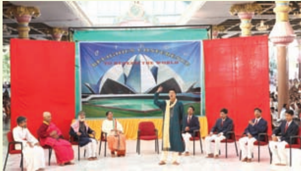
The drama "Sai – the Saviour" enacted by the students of Sri Sathya Sai Higher Secondary School gave the message of unity of mankind.

T HE STUDENTS OF SRI SATHYA SAI Higher Secondary School, Prasanthi Nilayam presented a drama on 26th January 2010, the 61st Republic Day of India, on the unity of faiths in the Divine Presence of Bhagavan. The drama depicted that Bhagavan