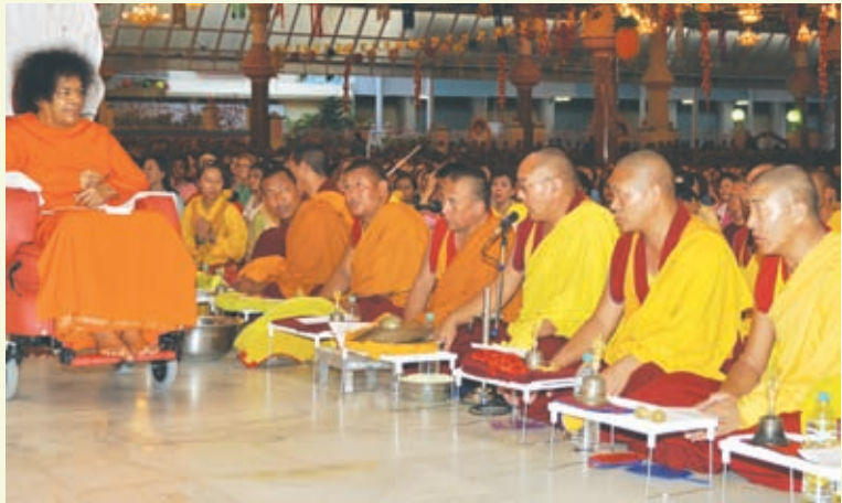
Chanting of sacred Buddhist Mantras was done by 36 Buddhist monks in Sai Kulwant Hall on 19th February 2010 as part of Chinese New Year celebrations at Prasanthi Nilayam.

Bhajans, at the end of which Arati was offered to Bhagavan which marked the conclusion of the morning programme. In the afternoon, the chanting of sacred Buddhist Mantras for world peace began at 5.45 p.m. The chanting was