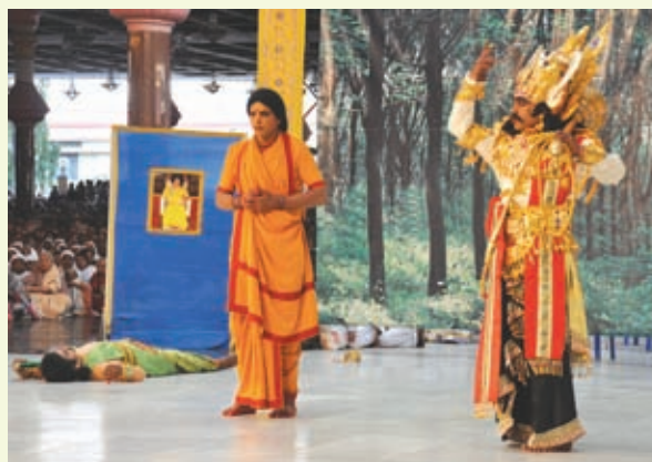
A scene from the drama "Satyavan Savitri" presented by the devotees of Nilgiris in Sai Kulwant Hall on 7th February 2010.

About 700 devotees came from Nilgiris, Tamil Nadu on a pilgrimage to Prasanthi Nilayam from 4th to 7th February 2010 and received the benedictions of Bhagavan. On 7th February, a group of these devotees presented a dance drama entitled "Satyavan Savitri" in the folk art form "Therukoothu" (street play) of Tamil Nadu. The drama began in the Divine Presence of Bhagavan after He arrived in Sai Kulwant Hall at about 5.00 p.m. Through beautiful dances, the drama depicted