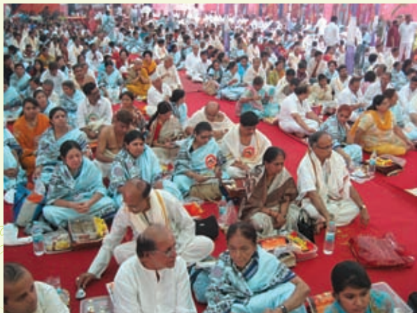
Devotees taking part in Sri Sathya Sai Paduka Puja Mahotsava at Dharmakshetra, Mumbai.

Maharashtra and Goa: Sri Sai Padhuka Trust conducted a Sri Sathya Sai Paduka Puja Mahotsava (function to worship the sandals