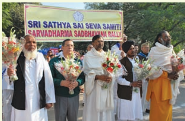
Religious heads of different faiths flagged off the Sarvadharmha Sadbhavana Rally organised by Sri Sathya Sai Seva Organisation of Delhi-NCR on 20th December 2009.

Delhi: A Sarvadharmha Sadbhavana (amity among faiths) Rally was organised by Sri Sathya Sai Seva Organisation, Delhi-National Capital Region at Noida on 20th December 2009. Bal Vikas children, students of Sai School in Noida, Samithi members