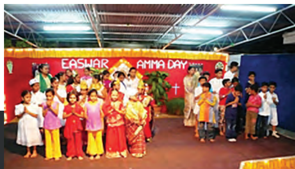
Bal Vikas children of Tanzania presented a delectable cultural programme comprising skits, poems, speeches and dances on the occasion of Easwaramma Day, celebrated in Dar es Salaam on 6th May 2008.

Easwaramma Day was celebrated in Dar es Salaam on 6th May 2008. About 100 persons attended the event. It was a joyous occasion