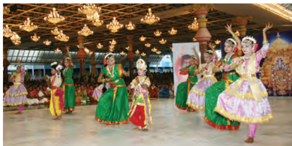
Devotees of Kadapa district of Andhra Pradesh came to Prasanthi Nilayam on pilgrimage and presented beautiful devotional songs of saint poet Annamayya through a dance drama on 6th September 2008.

The dance drama that followed this distribution immersed one and all in devotional fervour when the students performed exhilarating dances while playback singers