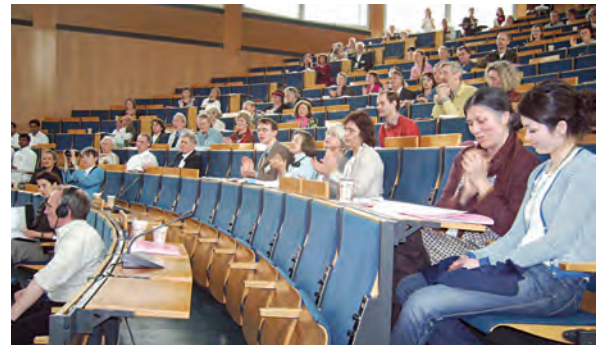
The first medical conference of Sri Sathya Sai Organisation of Germany was held at Hannover Medical School on 25th April 2008, in which about 150 participants from Germany, Austria and U.K. took part.