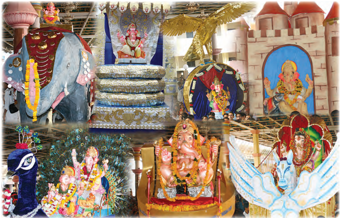
It was a feast for the eyes to see the grand spectacle of Ganesh idols on attractively designed vehicles which were lined up in Sai Kulwant Hall for Bhagavan's blessings before the immersion of the idols on 5th September 2008.

On the afternoon of 5th September 2008, these consecrated idols were brought to Sai Kulwant Hall by the groups of students and staff on charmingly decorated vehicles for Bhagavan's blessings before they were taken out of the hall for immersion. Bhagavan came to Sai Kulwant Hall at 4.00 p.m. in a grand procession led by Panchavadyam, Nadaswaram and Veda chanting groups of students. This procession also included two groups of Primary School students, one wearing