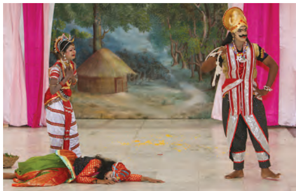
Bal Vikas children of Kerala presented the dance drama "Savitri – the Embodiment of Shakti" in Sai Kulwant Hall on the afternoon of 12th September 2008.

– From Bhagavan's Divine Discourse in Sai Ramesh Krishan Hall, Brindavan, Whitefield (Bangalore) on 31st May 2008.