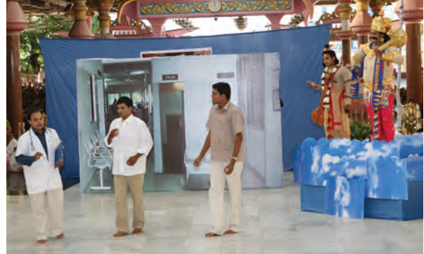
Sai Youth of Tamil Nadu presented a drama "Sri Sathya Sai Kavacham" in Sai Kulwant Hall on 26th August 2008 which beautifully highlighted the teachings of Bhagavan.

On the afternoon of 26th August, 2008, Sai Youth of Tamil Nadu presented a drama "Sri Sathya Sai Kavacham" which depicted how Bhagavan Sri Sathya Sai Baba was protecting mankind from the evil forces of hatred, jealousy, violence, lust and greed to usher in the golden age of love, peace, righteousness, truth and goodness on earth.