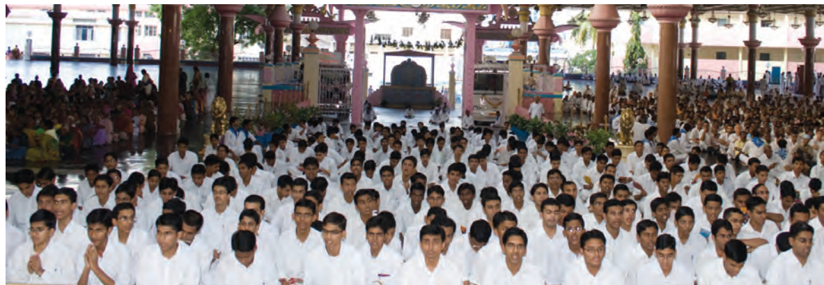
Collective chanting of Rudram being practised by the students and devotees in Sai Kulwant Hall.

The Vedas are divided into three parts – Karma Kanda (ritualistic portion), Upasana Kanda (worship portion) and Jnana Kanda (knowledge portion). Rudram forms the Karma Kanda part of Krishna Yajur Veda and its chanting is prescribed for the performance of Homa or Yajna. 121 priests chanted Rudram 11 times daily for 11 days when Ati Rudra Maha Yajna was performed from 9th to 20th August 2006 at Prasanthi Nilayam and later from 20th to 30th January 2007 in Chennai. But Rudram is not limited to chanting during the performance of Yajna only. It is equally popular as Upasana (worship) and Jnana (knowledge). Its chanting is very efficacious for personal as well as environmental purification. As the sacred texts declare, its chanting is one of the most potent means for the expiation of all sins. Moreover, its Mantras give the knowledge of the omnipotent, omniscient and omnipresent Rudra which takes the practitioner to the path of liberation. Collective chanting of Rudram is therefore considered a highly beneficial practice for the greatest good of all.