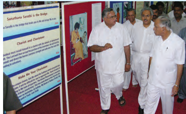
Besides over 32,000 people from all walks of life, many dignitaries visited “Prema Jyothi” and “Journey with Sai” exhibition set up at Palace Ground, Bangalore from 12th to 21st September 2008. The picture shows the Chief Minister of Karnataka, Sri B.S. Yeddyurappa going round the exhibition.

The first part of the exhibition entitled “Prema Jyothi” presented a glimpse of the