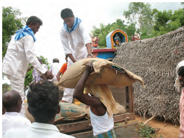
Chennai Metro North district organised the sale of quality seeds of paddy to farmers of four adopted villages on 12th and 13th August 2008.

Tamil Nadu: Chennai Metro North district has adopted four villages, namely, Errukkuvai, Errukkuvai Kandigai, Manali and Serpedu under Sri Sathya Sai Village Integrated Programme. These four villages comprising a population of 1,000 with 300 families have