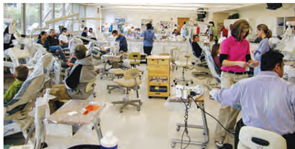
Sri Sathya Sai Organisation of America (Region 6) organised a dental camp at Eugene, Oregon on 2nd May 2008 which provided dental services to 73 children and adults.

A dental camp was organised at Eugene, Oregon by Sri Sathya Sai Organisation of America (Region 6) in partnership with a local dental clinic on 2nd May 2008. The camp served 73 children and adults. Many saw a dentist for the first time. Following the X-ray