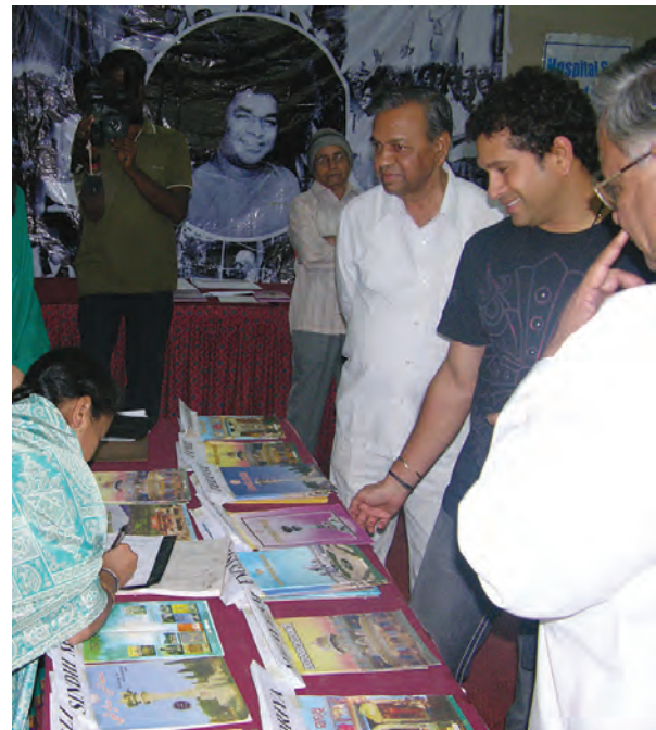
After seeing the exhibition with great interest, famous cricketer Sachin Tendulkar subscribed for “Sanathana Sarathi” at the “Sanathana Sarathi” stall where all its editions in 25 Indian and overseas languages were displayed.

massive work done by Bhagavan for the welfare of the masses through His humanitarian projects like hospitals, educational institutions