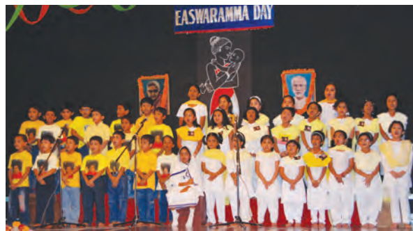
Easwaramma Day was celebrated at Sri Krishna Temple Hall, Muscat on 9th May 2008. The programmes conducted on this occasion included a cultural programme by 265 Bal Vikas children of the Sultanate of Oman.

Easwaramma Day was celebrated in Oman on 9th May 2008 with a bouquet of programmes