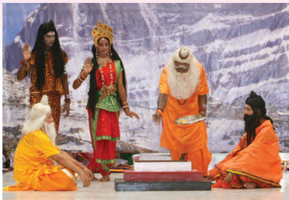
Sai Youth of Uttar Pradesh and Uttarakhand presented a dance drama in Sai Kulwant Hall on 18th September 2008, portraying the events of the Advent of Bhagavan Sri Sathya Sai Baba and depicting His humanitarian tasks.

Sri Sathya Sai Seva Organisation of Uttar Pradesh and Uttarakhand organised a youth camp at Prasanthi Nilayam from 15th to 19th September 2008 in which more than 1,000 youth, both boys and girls, of these two States took part. The youth undertook various service activities, attended talks by eminent speakers and experienced the bliss of Bhagavan's Darshan in Sai Kulwant Hall. On the afternoon of 18th September 2008, a group of these youth presented a dance drama "Sri Sathya Sai Avatar Rahasya", depicting the main events of the life of Bhagavan Sri Sathya Sai Baba and the various humanitarian and spiritual tasks undertaken by Him to serve, unite and elevate mankind. The story of the Advent of this Avatar of infinite glory was traced through the penance of Rishi Bharadwaj who was granted the boon by Lord Siva and Parvati that they would incarnate in Kali Yuga in the three forms of Shirdi Sai, Sathya Sai and Prema Sai to establish righteousness on firm footing and usher in a era of love and peace in the world. The drama that started at 4.45 p.m. came to a close at 5.15 p.m. Bhagavan sat through the