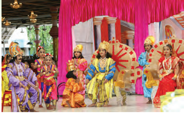
A scene from the dance drama "Rama – the Embodiment of Love" presented by the Bal Vikas children of Kerala in Sai Kulwant Hall on 11th September 2008.

of the most outstanding performances from all points of view – be it direction, acting, music, costumes or dances. At the conclusion of this dance drama, Bhagavan showered His blessings on the children, posed for group photos with them, distributed clothes to them and interacted with them.