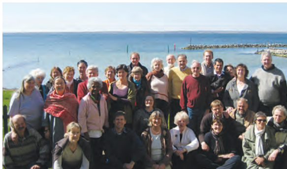
In the Annual National Sadhana Camp of Denmark held from 18th to 20th April 2008, the participants shared their experiences and discussed how the teachings of Bhagavan helped them in their transformation.

The first medical conference of Sri Sathya Sai Organisation of Germany was held at Hannover Medical School on 25th April 2008. The objective of the conference was to make the general public and health professionals aware of the significance of Sathya Sai Human