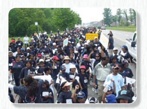
Participants in the Canada Walk for Values.

Sathya Sai devotees in Toronto conducted 4th Annual Walk for Values on 28th May 2006, in which over 3,000 participants walked the 4