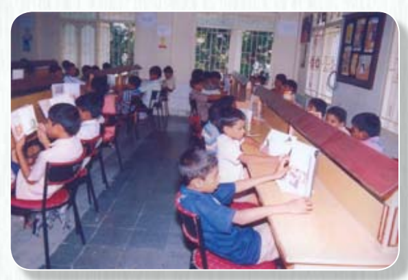
Sri Sathya Sai Deenajanoddharana Pathakam children engaged in self-study during the summer retreat organised by Sri Sathya Sai Seva Organisation of Andhra Pradesh at Visakhapatnam.

arranged for their entertainment and learning. They were taken to various places of tourist interest like Kailasgiri, Vuda Park, R.K. Beach and Simhachalam. They were also engaged in service activities undertaken by the Sai Organisation in various villages to make them realise the value of selfless service. At the conclusion of the summer retreat, each child was given many gift items.