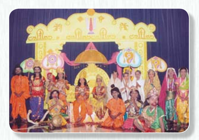
Bal Vikas children of Indiranagar Sai Samithi presented a drama on the women characters of the Ramayana on 31st May 2006.

Bal Vikas children of Indiranagar Sai Samithi presented a drama portraying the