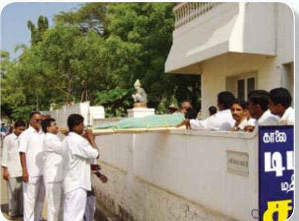
Disaster management training being provided to the youth for conducting rescue and relief operations during disasters and natural calamities.