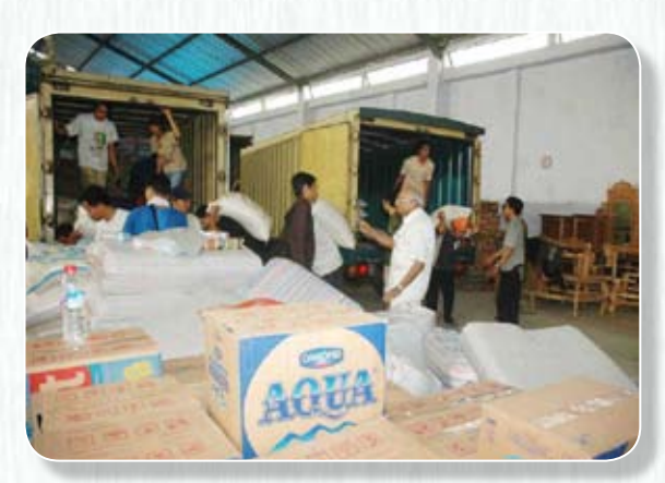
Relief supplies being sent to the earthquake victims of Yogyakarta by Sri Sathya Sai Organisation of Indonesia.

On 27th May 2006, a 6.3-magnitude earthquake shook the area around Indonesia's ancient royal city of Yogyakarta on the island of Java. The earthquake destroyed 40,000 houses, left 60,000 people homeless and about 6,000 people were killed. The tectonic quake was centred in the Indian Ocean about 38 km to the south of Yogyakarta at a depth of