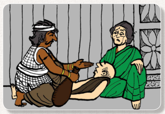
"This act of pouring water into this old man's mouth is the only good deed I can claim to have performed", admitted the thief.

Lord Visweswara. But my husband has fainted due to intense thirst. I am begging everyone to pour some water into his mouth. But nobody has shown any compassion towards us."