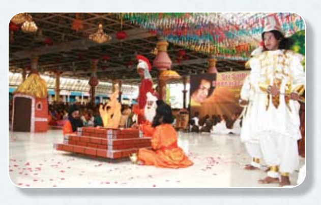
The cultural programme presented by the children of Sri Sathya Sai Deenajanoddharana Pathakam showcased the eternal values of the culture of Bharat.

them a new life. The confidence with which he spoke conveyed that destitute children could