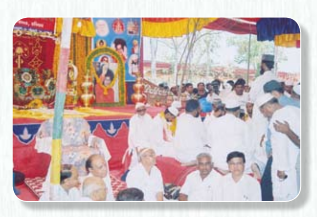
Organisers and participants at the venue of the mass marriages organised by the Sai Organisation of Gujarat.

A State-level Seva Sadhana workshop was conducted on 14th and 15th April 2006 at Navsari, in which approximately 1,500 devotees took part. The subjects of the workshop included blood donation, Bhajans, study circle, Veda chanting, Sri Sathya Sai