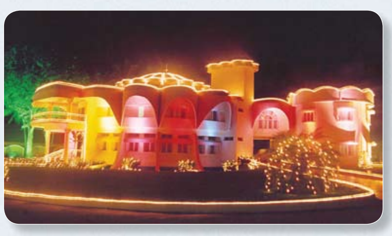
Trayee Brindavan, the abode of Bhagavan in Brindavan (Whitefield), gloriously illuminated on its 23rd Anniversary celebrations.

In the afternoon, a magnificent programme of devotional songs was