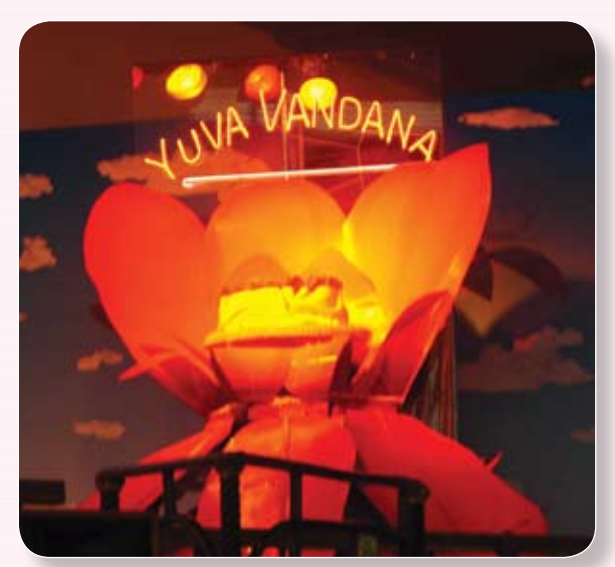
Youth Camp "Yuva Vandana 2006" was inaugurated by Bhagavan on the morning of 27th May 2006 by pressing a switch with which a huge lotus placed on the dais bloomed.

dais, Bhagavan inaugurated the Camp at 8.00 a.m. by pressing a remote controlled switch, with which a huge lotus placed on the dais bloomed and all the photos of Bhagavan were illuminated. While Bhajans continued, Bhagavan came down from the dais and blessed the school kits which were distributed to more than 1,000 school children, dressed in immaculate white clothes earlier blessed by Bhagavan, from various villages where service activities were being conducted by the Sai Organisation. After this, Bhagavan went into the rows of youth and other devotees to shower the bliss of His Divine Darshan on them. After Bhagavan came back to the dais, a group of Bal Vikas children presented an excellent dance in front of the dais to the tune of the theme and welcome song played in the background. This was followed by a programme of soulstirring melodies presented by two renowned