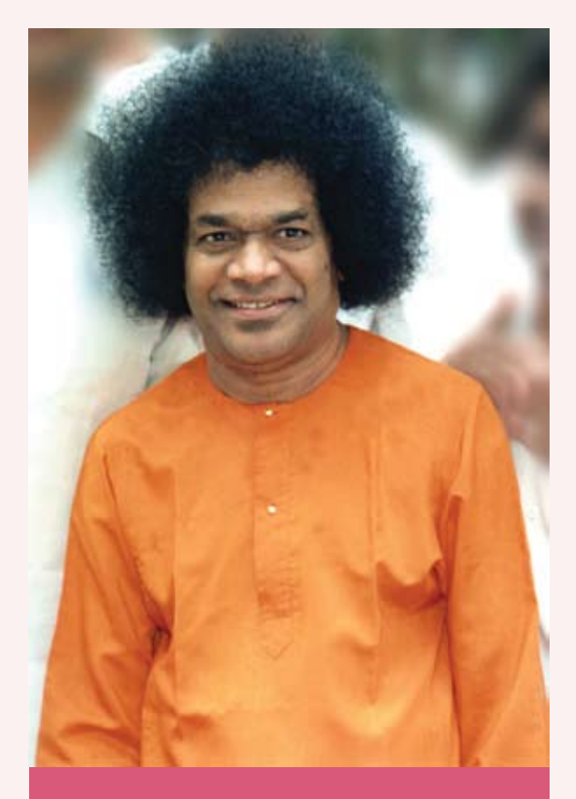
Modern students are highly intelligent. Their intelligence should be properly channelised. They should be made aware of what is important for them in life. That is the type of education we have to give them. But, due to the impact of western culture, students are being given such education that has no relevance to their life. Under the influence of western culture, they are developing limitless desires, unnecessary relationships and are crossing the limits of propriety.

The world has acquired the name Prapancha as it is the manifestation of the Pancha Bhutas (five elements). Man today is misusing them. He thinks it is quite natural for him to exploit them to his maximum advantage. But it is most unnatural and unsacred. It may seem to be good and natural for the time being but later on he will be faced with insurmountable difficulties. These five elements are present in every human being in the form of the senses of Sabda, Sparsha, Rupa, Rasa and Gandha (sound, touch, form, taste and smell). Your life will be redeemed only when you make proper use of the five senses and the five elements. Never use your senses in an unsacred manner. Today people are interested in seeing wrong things. They are all ears when someone indulges in vain gossip and evil talk. Never lend your ears to evil talk and get carried away by it. God has blessed you with two eyes and two ears so that you may see His beautiful form and hear His sweet and sacred name. It is only when you adhere to these principles can you lead the life of a true human being. Human birth is highly sacred. Jantunam Nara Janma Durlabham (out of all living beings, human birth is the rarest). It has been called rare and precious because you can perform