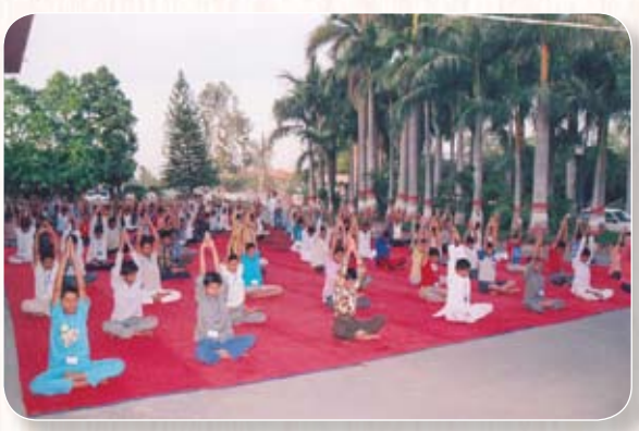
Yoga practice was one of the activities of the Summer Course on Indian Culture and Spirituality held at Indore.

The day started at 5.20 a.m. and all the students participated daily in Omkaram, Suprabhatam and Jyoti Dhyana followed by