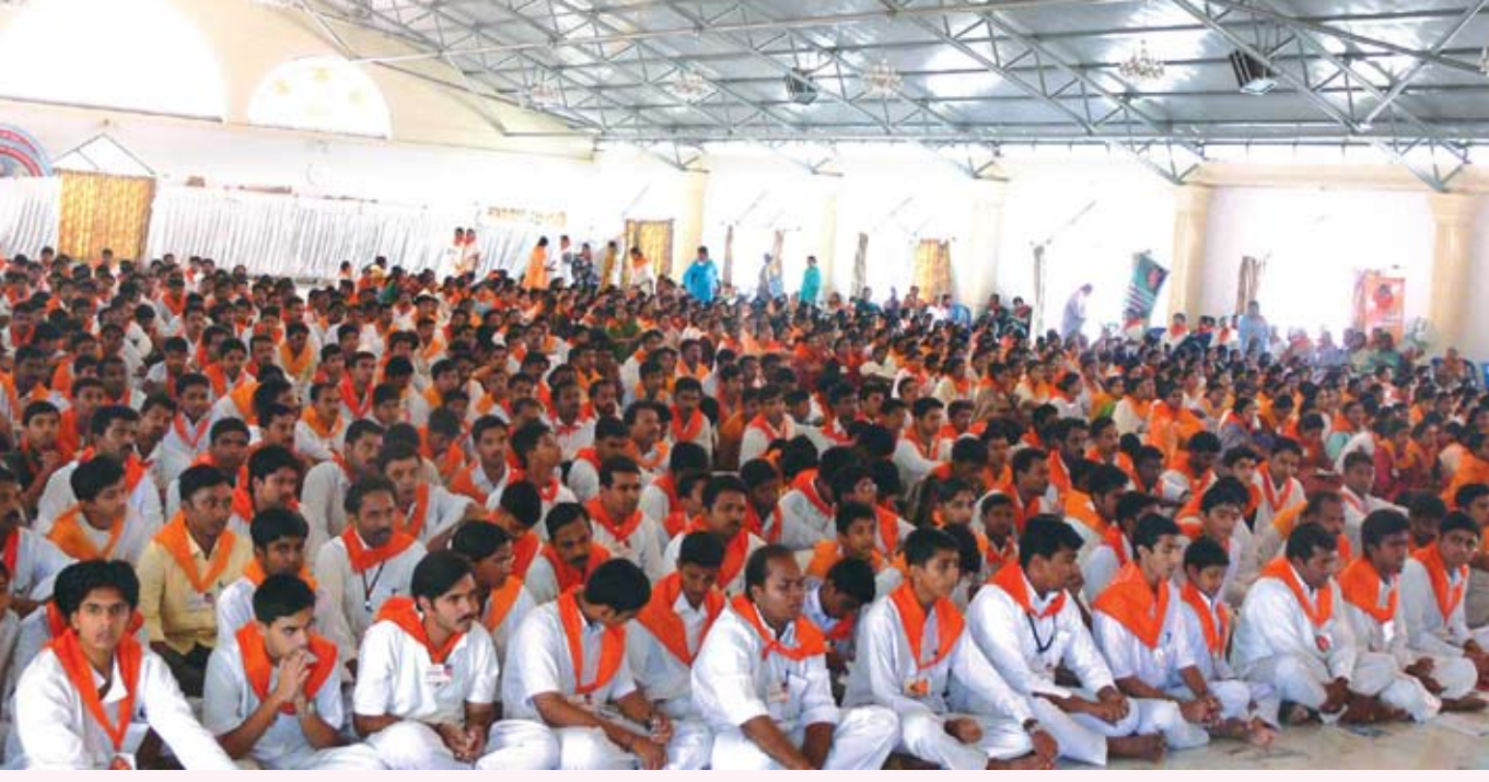
A Plenary Session of the Youth Camp in progress in Sai Krishan Kalyana Mandapam, Brindavan.