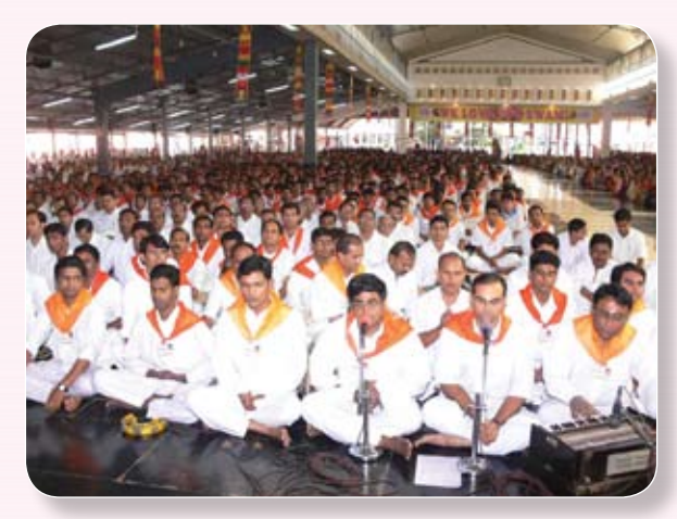
Soul-stirring Bhajans led by Sai Youth of Kerala formed an important part of the Sadhana Camp organised at Brindavan on 19th-21st May 2006.

On the morning of 19th May 2006, Bhagavan came to the richly decorated Sai Ramesh Krishan Hall amidst auspicious notes of Nadaswaram. Bhajans in the Hall, after the arrival of Bhagavan were led by Sai Youth of