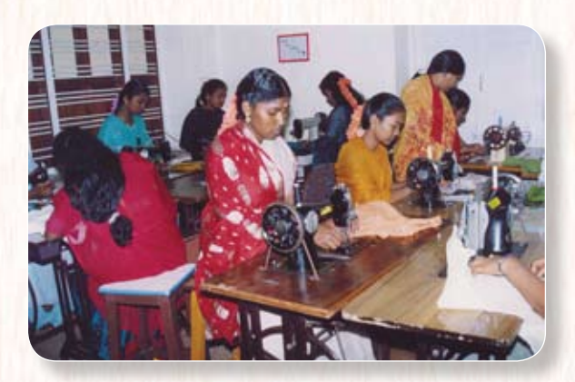
Sri Sathya Sai Seva Organisation, Tamil Nadu has made more than 80 women selfreliant in the Mahila Vocational Training Centre, Chennai Metro.

Tamil Nadu: The Mahila Vocational Training Centre started by Sri Sathya Sai Seva Organisation, Tamil Nadu in Chennai Metro in March 2001 has so far imparted vocational training in tailoring and other vocations to