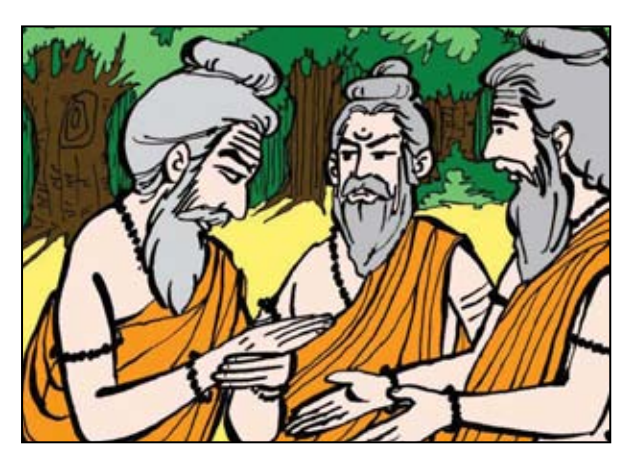
"When, being a scorpion it did not forget its nature, how can I, being a human, leave my nature?" said the renunciant to his companions.

Man can realise the truth of his reality only when he recognises his Dharma or true nature.