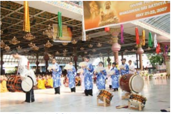
The youth of Okinawa, Japan performed a scintillating dance to the beat of drums as part of Buddha Purnima celebrations at Prasanthi Nilayam on 21st May 2007.

was a dance by the Bal Vikas children of Hong Kong. Their graceful movements to the tune of drum music delighted one and all. This was by another followed dance by the youth of Okinawa, Japan in their colourful dress along with a turban. First. they made beautiful formations with red flags in their hands and then performed a vigorous dance while playing on the small drums in their hands. After this began the sacred ceremony of bathing the idol of