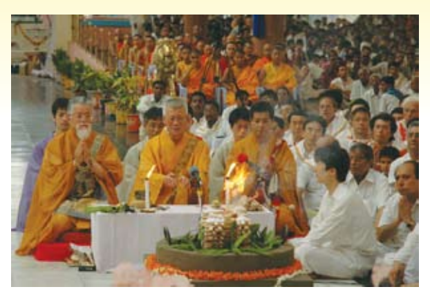
Buddha Purnima celebrations came to a happy conclusion at Prasanthi Nilayam with the traditional closing Buddhist ceremony "Gomadaki".

The closing Buddhist ceremony "Gomadaki" was performed to bring the programme to its sacred conclusion. Buddhist priests chanted sacred Mantras in front of fire, filling the entire milieu with sacred vibrations. Buddha Purnima