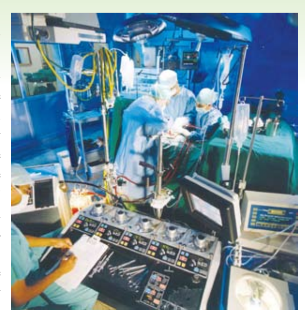
The state-of-the-art operation theatre equipped with latest equipment makes complicated surgeries possible in Sri Sathya Sai Institute of Higher Medical Sciences.