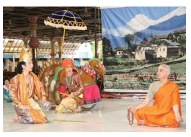
A scene from the drama "The Story of Buddha" presented by the Japanese youth in Sai Kulwant Hall on 21st May 2007.

After these speeches, the Japanese youth presented the drama "The Story of Buddha", depicting the life and teachings of Buddha by enacting some significant episodes from his life. Realistic performance of these episodes made the drama a lively presentation. Bhagavan blessed the participants of the