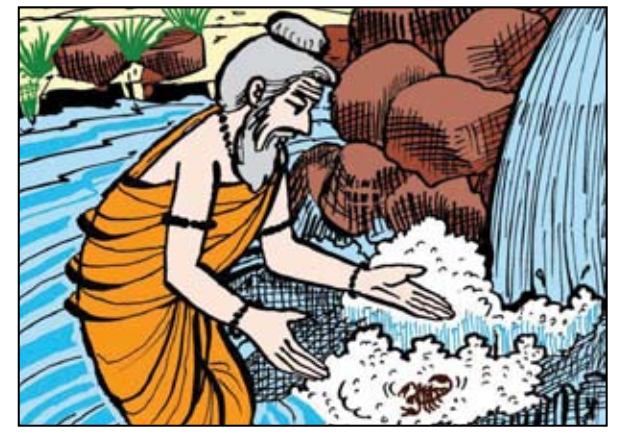
Without caring how many times the scorpion bit him, the renunciant ultimately succeeded in saving its life.

NCE SOME SANNYASINS (renunciants) were walking along the bank of the Ganga. Looking at the sublimely flowing Ganga, they were experiencing great bliss. At one place, a big depression was caused