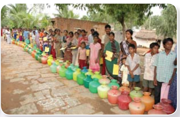
Sri Sathya Sai drinking water supply to villages surrounding Puttaparthi.